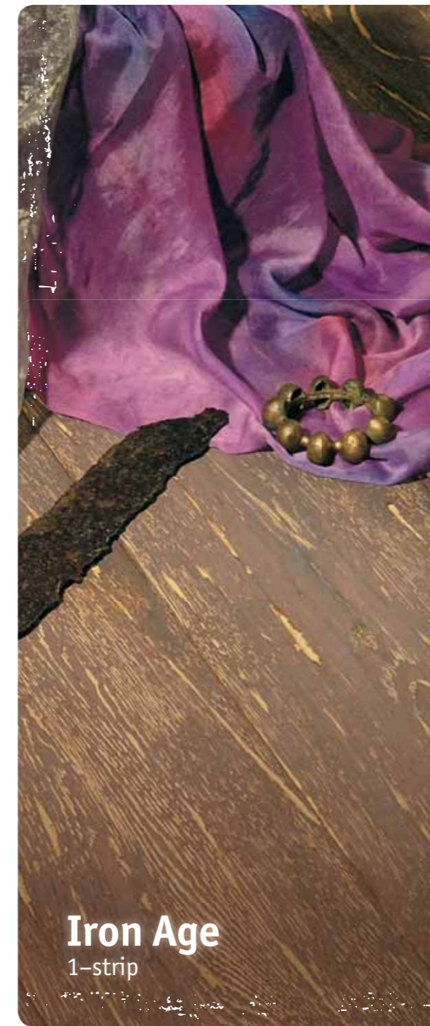
Iron Age 1-strip