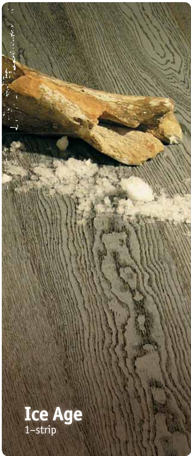
Ice Age 1-strip