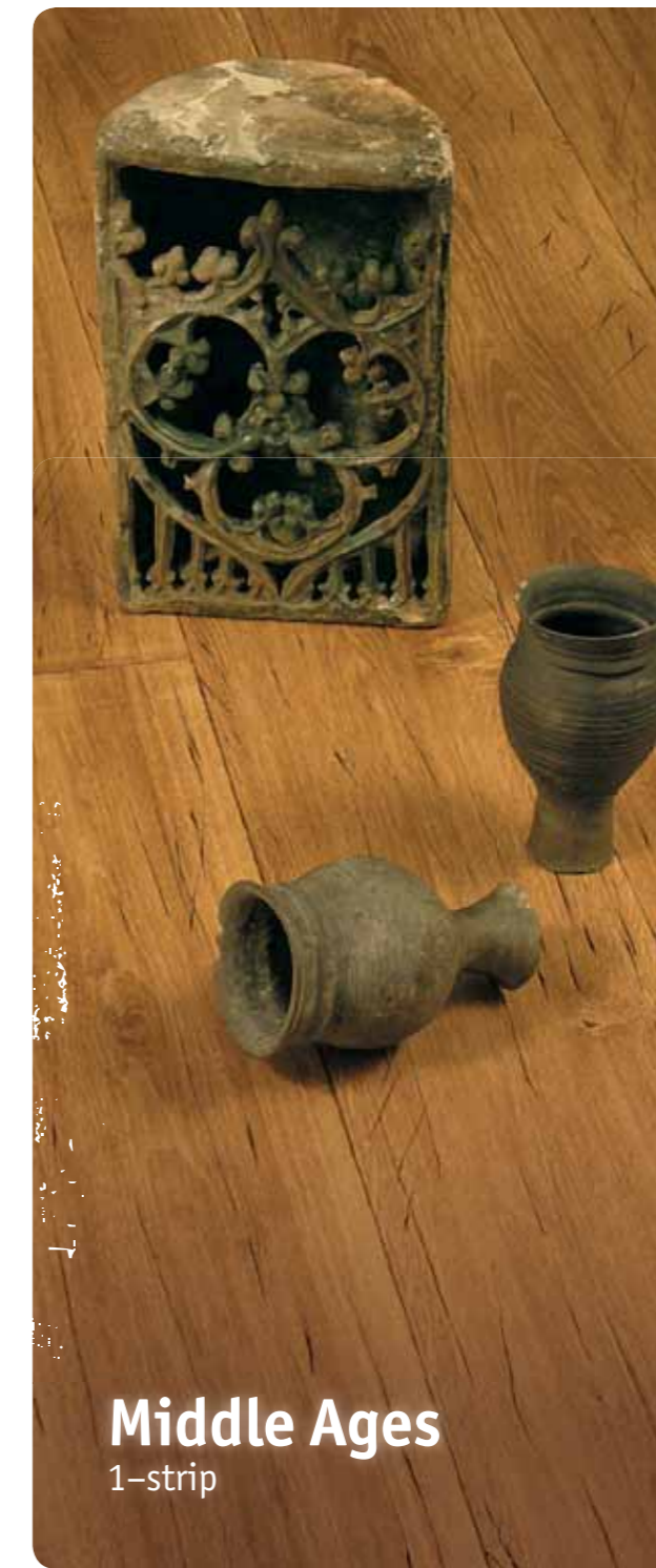
Middle Ages 1-strip