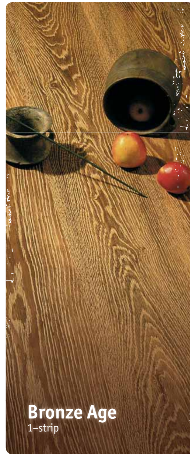
Bronze Age 1-strip