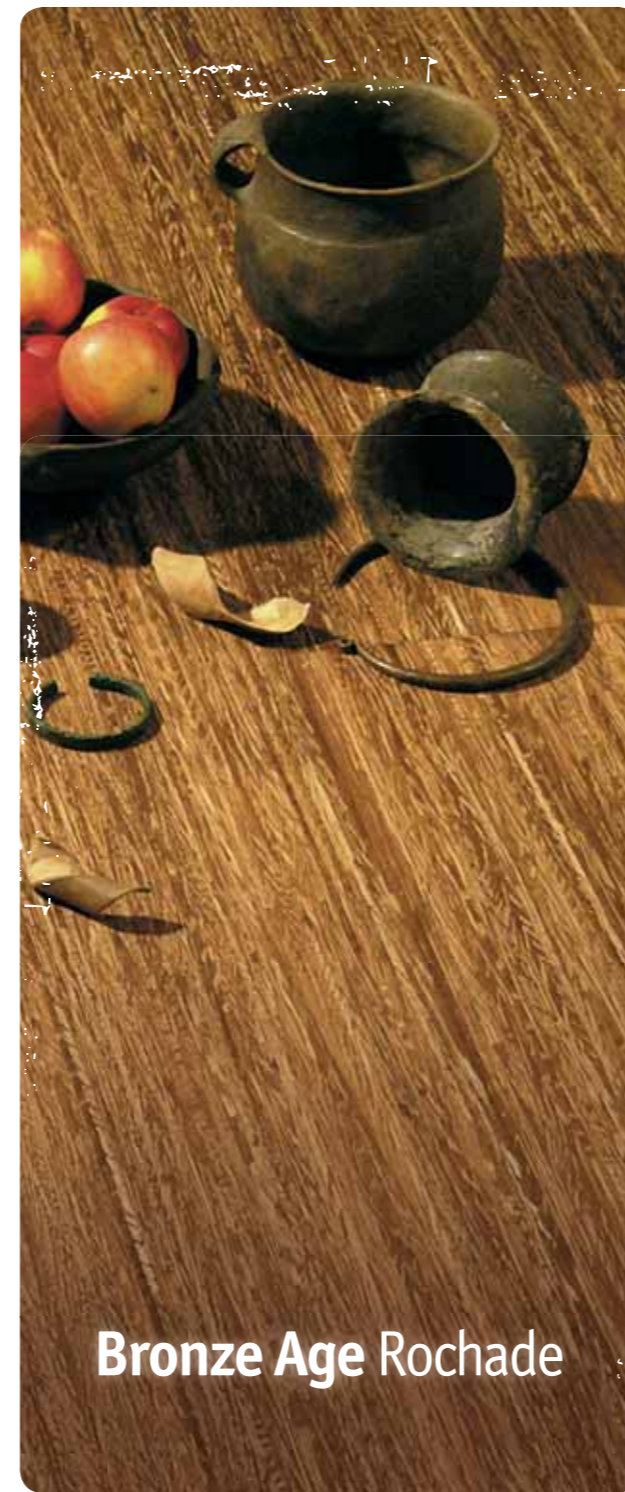
Bronze Age Rochade