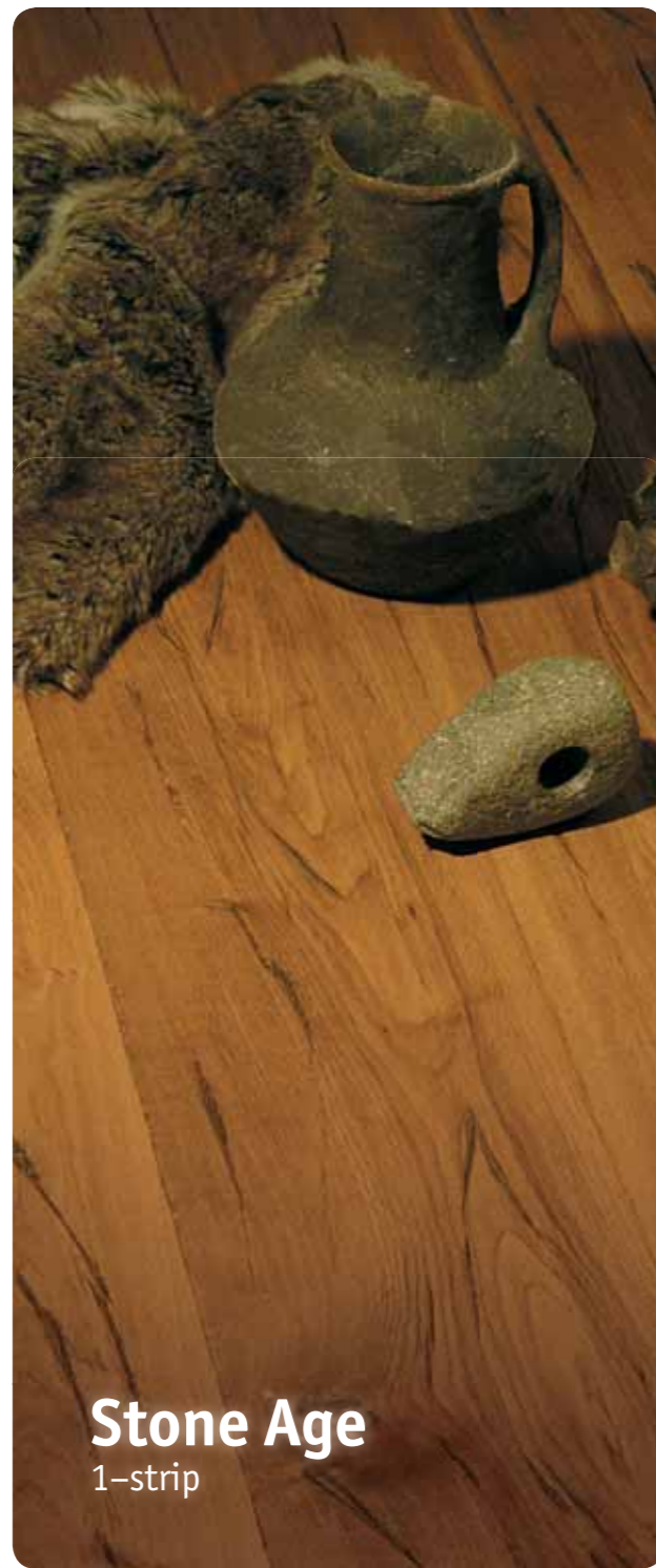
Stone Age 1-strip